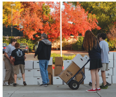
Kids Can Food Drive Collection Day

The Roseville Salvation Army tells us they always look forward to stopping at St. Albans in November to pick up the food items donated to the KCRA 3 Kids Can Food Drive. Each year the amount of items our families donate rivals the amounts collected by area high schools. This year our families donated over 6,300 items that were distributed to local food banks.