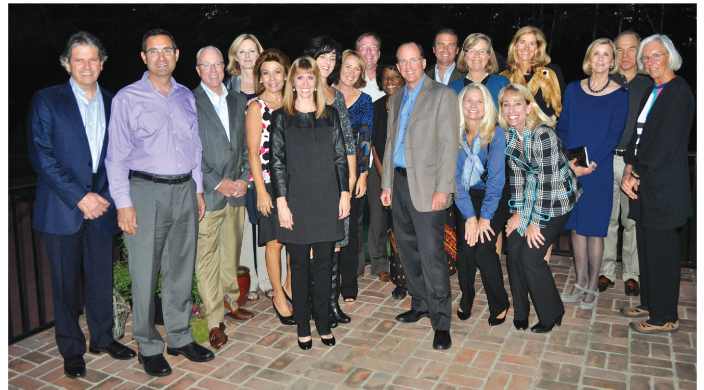
Past and current St. Albans Country Day School Executive Board Members

Later this school year, look for a new Volunteer Appreciation Board in the main office that will highlight volunteer efforts year-round.