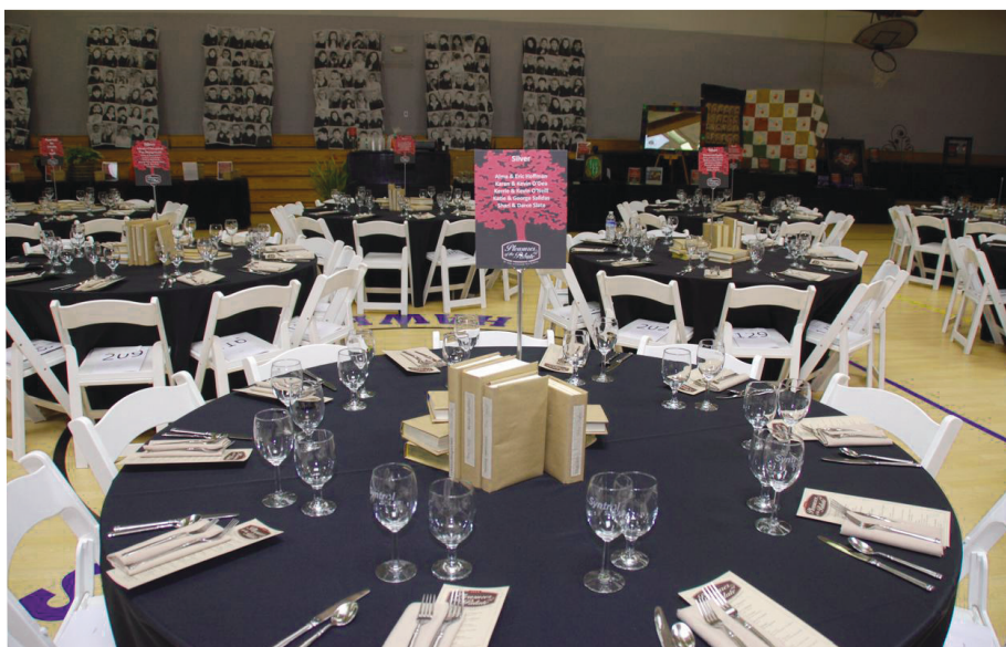
Getting Taber Center ready for Pleasures 2013

Each fundraiser requires dedicated volunteers, and in many cases also requires a significant time commitment. Please know your enthusiasm for Development and SAPA fundraisers ensures St. Albans is able to provide the quality and variety of academic and extracurricular programs that give each student the opportunity to fulfill his or her potential. Thank you for your support.