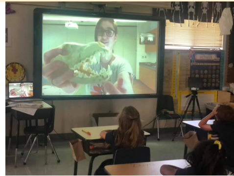
Effie Yeaw Sacramento Nature Center brought their exciting field trip to our 2nd Graders remotely.