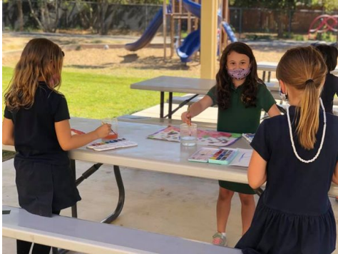
1st Graders enjoying an outdoor art class.