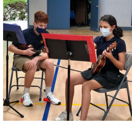
8th graders learned ukulele in place of wind instruments.