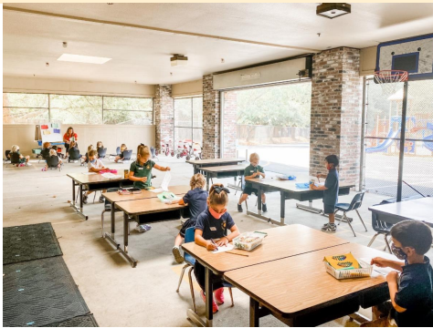
Kindergartners held "Centers" in the open air part of Day Care.