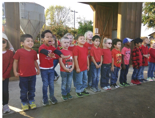
Pre-K takes a fieldtrip to Bishop's Pumpkin Patch