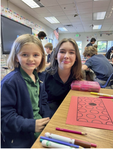
Kindergarten and 7th Grade Buddies