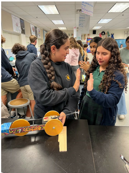
Annual 8th Grade Egg Car Races in Science Class