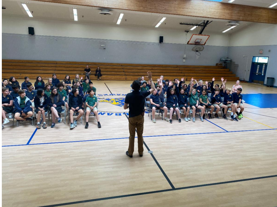
A local FBI agent holds a seminar with our 6th - 8th graders on online safety