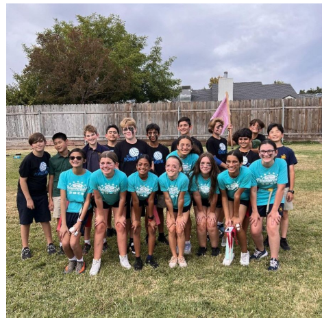
Our 8th & 7th grade Powder Puff teams.