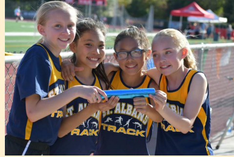
Fifth grade girls at Track & Field meet.