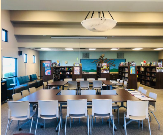
Interchangeable tables in the study area allow for varying size group projects, collaboration and individual work.

CLICK HERE to see a VIDEO of our students enjoying the Library!