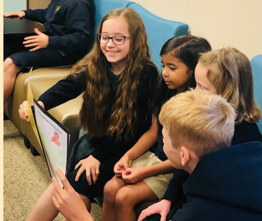
Fifth graders read storybooks they created in Library Class to their friends from kindergarten.