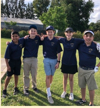
Members of our Golf Team pose at the final tournament.