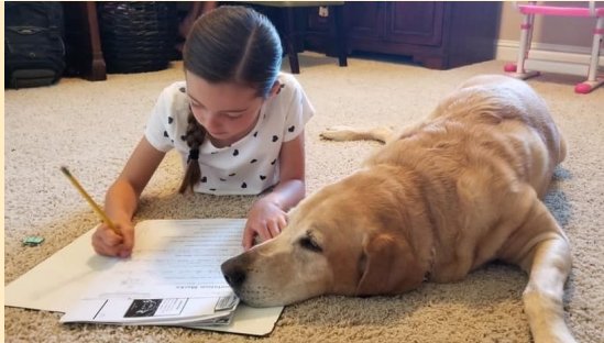
There were some perks for our students and their pets!

Our students nimbly adapted to using school technology like Google Classroom from their homes, and teachers discovered wonderful new tools to connect with students in meaningful ways on a daily basis. Our upper graders joined up to five Zoom video calls a day with their teachers and classmates. Here are a few snapshots of study time, class calls, science projects and homework!