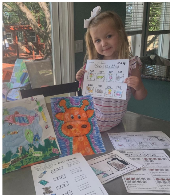
And a lot of work was accomplished!