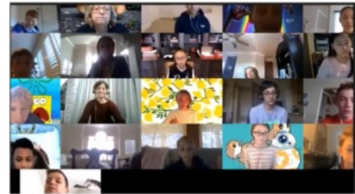
Zoom was at the center of our daily learning... and classes helped to ensure student connection.